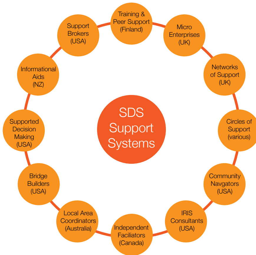
Figure 1. Various models of infrastructure for self-directed support